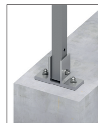
Foot plates with fix anchors