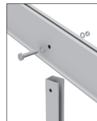
Support - rafter