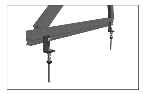
Adapter for hanger bolts