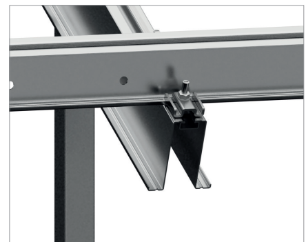
Connection detail module support