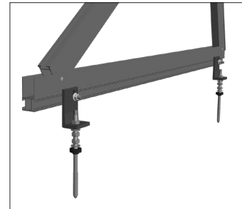
Adapter für Stockschrauben