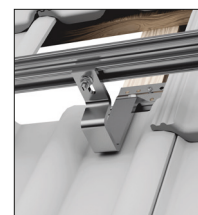
Double Roman Tiles