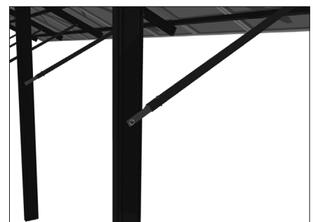
Linking of the diagonal to the C-post