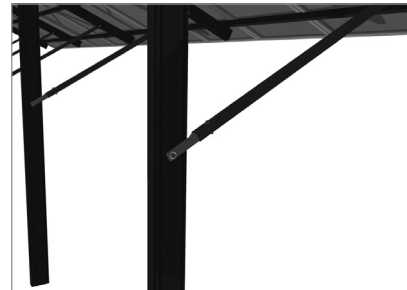
Linking of the diagonal to the C-post