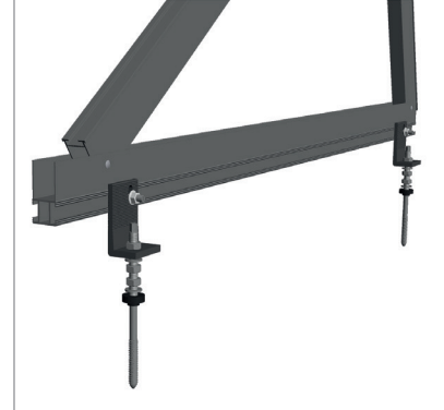
Adapter for hanger bolts