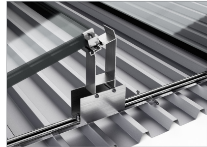
Detail back support